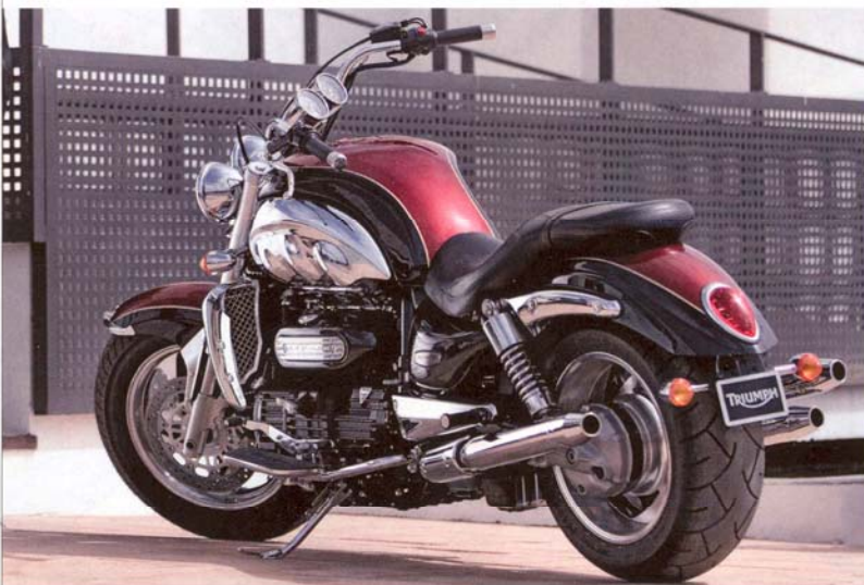
Ecosse Heretic (top) and Triumph Rocket III Classic (above).

often associated with cruisers, and neither is an in-line, longitudinal, 3-cylinder powerplant. You would expect a machine that displaces a startling 2.3 liters and carries more than six gallons of fuel to be both muscle-bound and overweight. But the Rocket's dry weight is just over 700 pounds, and the delivery of its 140 hp is as controllable as it is impressive. The wide but well-balanced Rocket, which has a starting price of $15,700, is a pleasure to ride. It offers a nimbleness that reminds you that it is, after all, built by Triumph, a company renowned for its performance bikes. —D.W. ☐