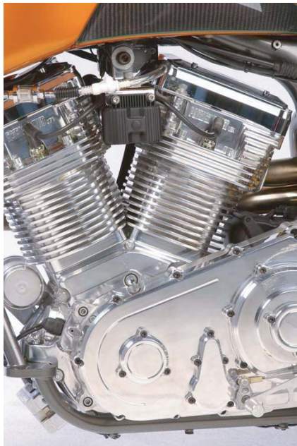
Precise detailing is what you would expect in an ultimate bike.